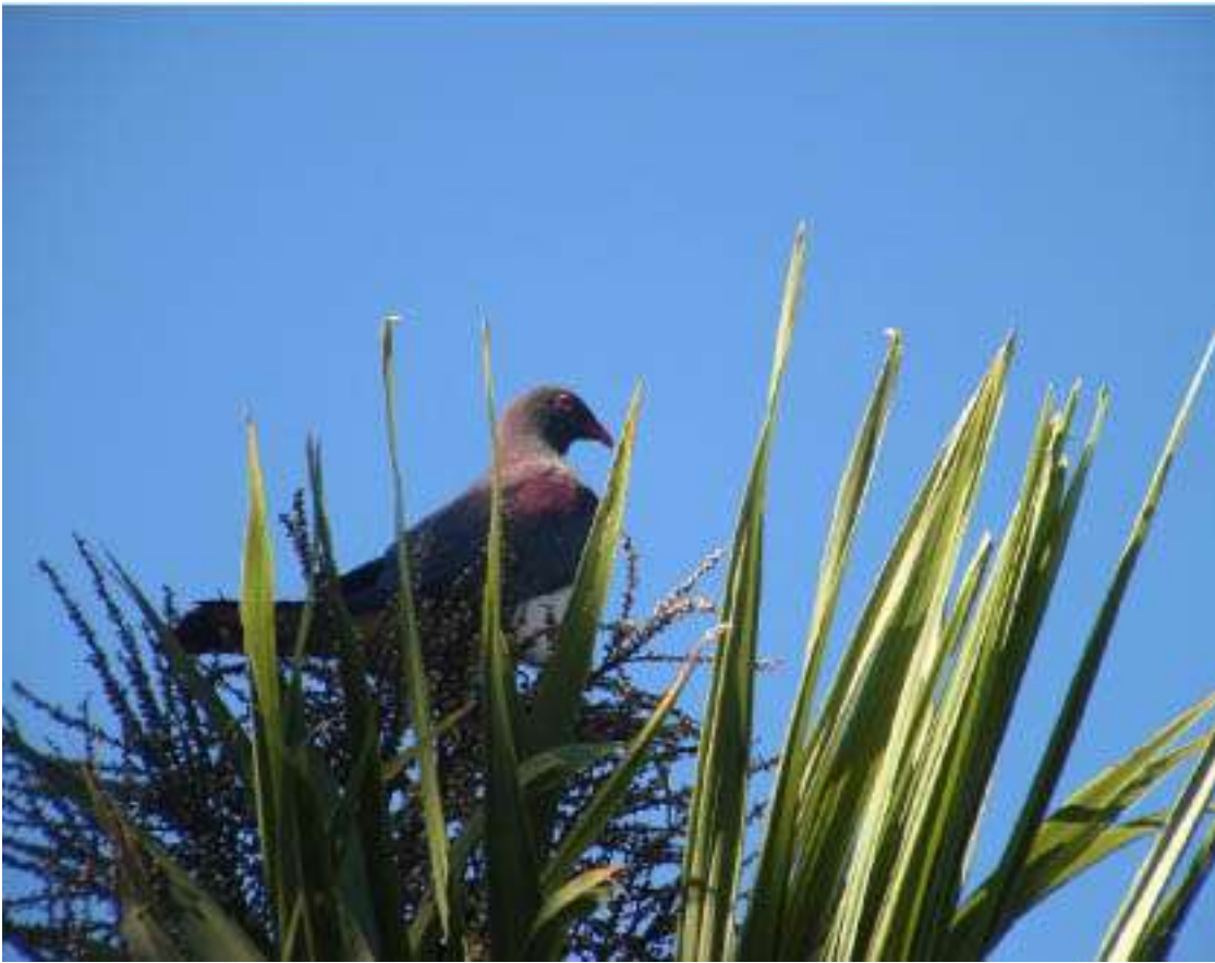
Keruru feeding on cabbage tree fruits