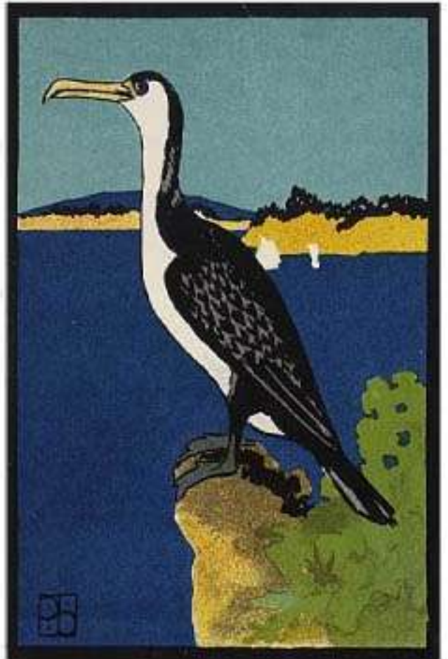
NZ Quail Pied Shag Keruru